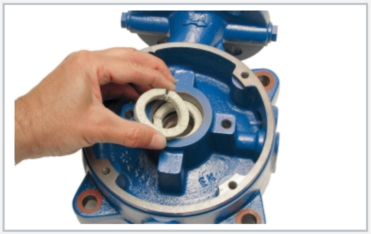
Assembly of the four-stage centrifugal pump: assembling the packing gland rings