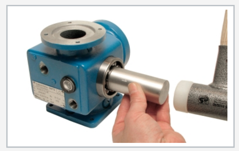
Assembly of the diaphragm pump: driving the eccentric into the housing (using a device)