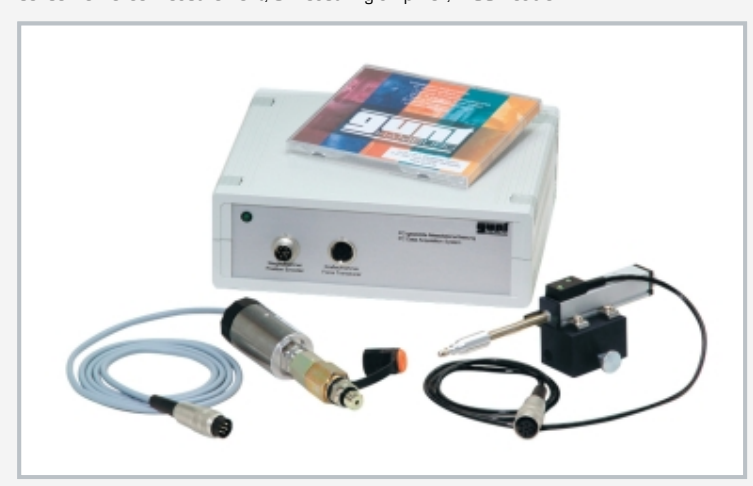
Assembled data acquisition system with software CD; in the foreground: left: pressure sensor, right: displacement sensor