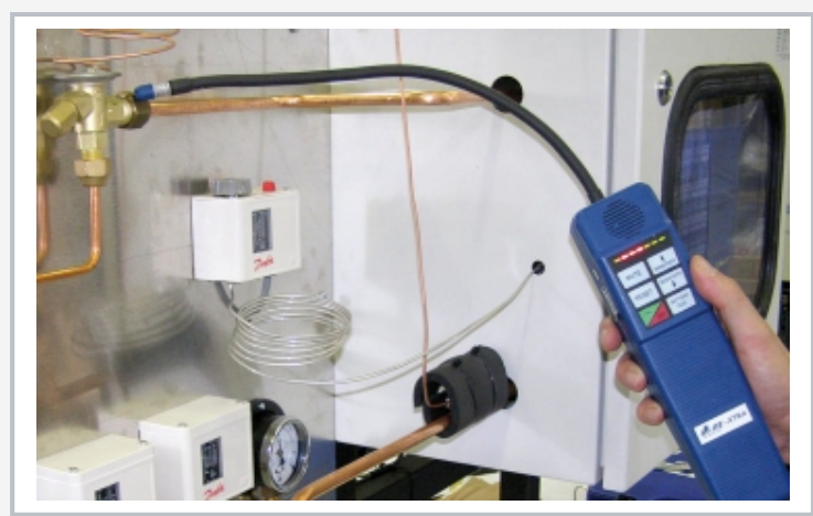
Leak test at the expansion valve of the fully assembled system

P pressure, PSL, PSH pressure switch; blue: low pressure, red: high pressure