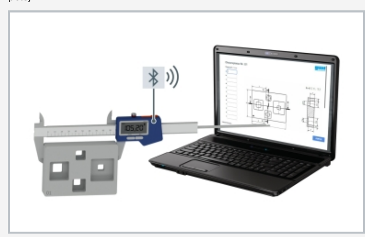
Digital calliper with Bluetooth interface enables direct transfer of measured values e.g. to the worksheets