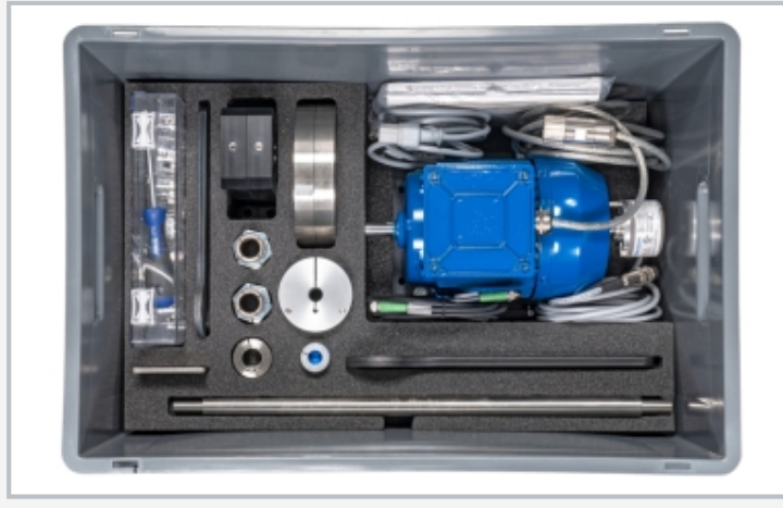
The illustration shows the components in the storage system