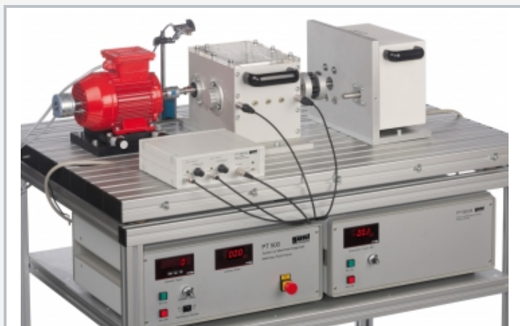
The illustration shows PT 500.05 together with PT 500, PT 500.01, PT 500.15 and PT 500.04.