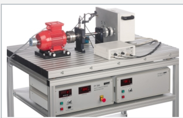
The illustration shows PT 500.13 together with PT 500, PT 500.01, PT 500.05 and PT 500.04.