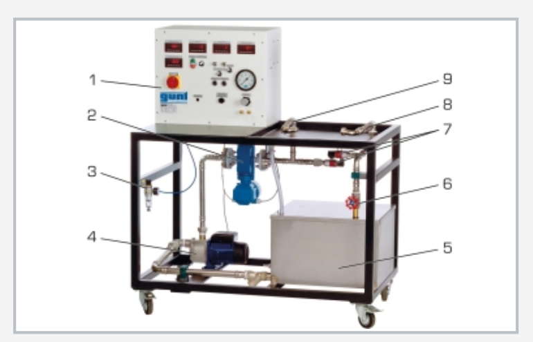
1 switch cabinet with controls, 2 flow rate sensor, 3 pressure reducing valve for air connection, 4 pump, 5 tank, 6 adjustement of flow rate, 7 pressure sensor, 8 outlet control valve, 9 inlet control valve