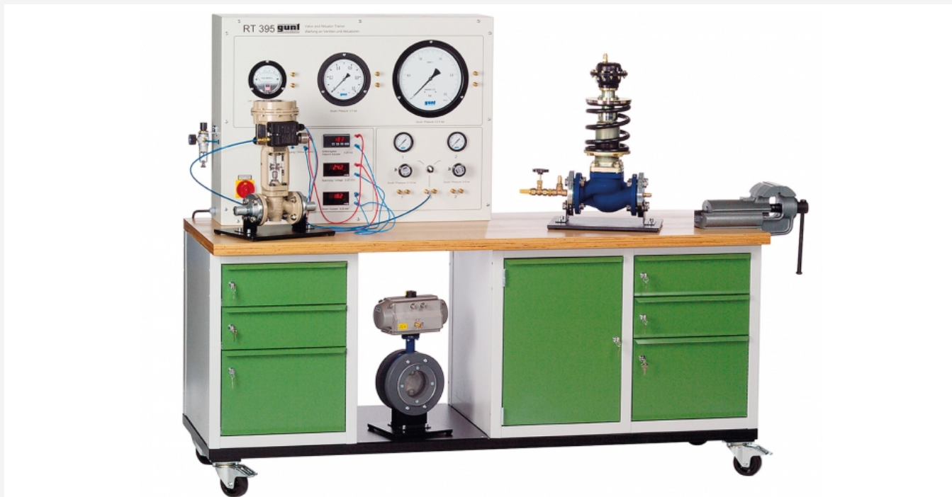
The illustration shows RT 395 with 3 of 4 fittings (segmented ball valve not shown).