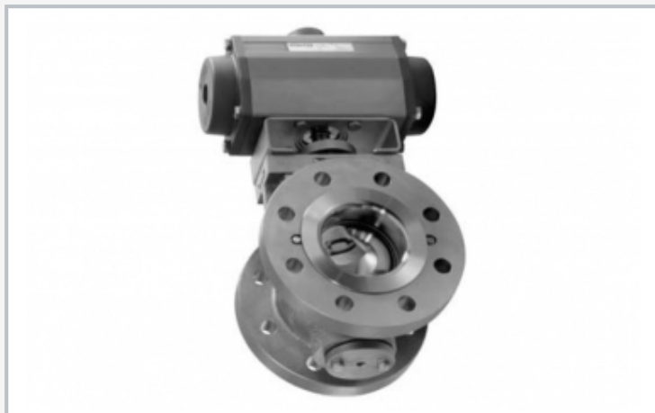
Segmented ball valve with single-action pneumatic swivel drive