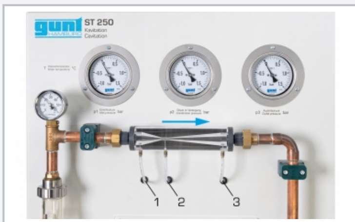
Pressure measurement at the Venturi nozzle with 3 measuring points and manometers: p_1 pressure at the inlet, p_2 pressure at the narrowest cross-section, p_3 pressure at the outlet; blue arrow: flow direction