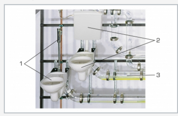
1 toilet bowl pressure flush, 2 toilet bowl with cistern, 3 transparent pipes