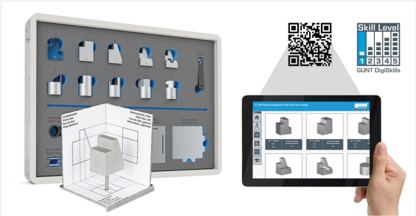
The illustration shows the device and the GUNT Media Center on a tablet (not included).