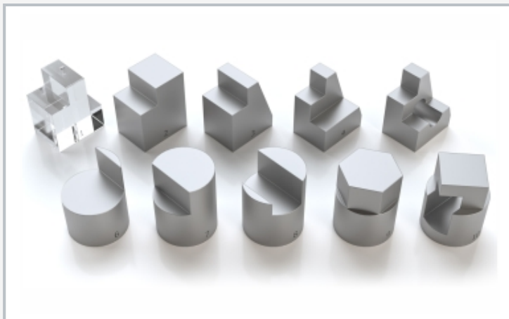
Prismatic and cylindrical models