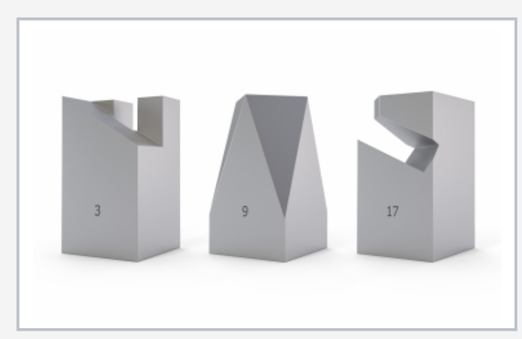
Models with cuts parallel and oblique to the spatial axes