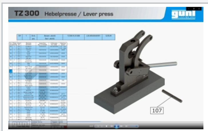
Screenshot of the GUNT Media Center: assembly video