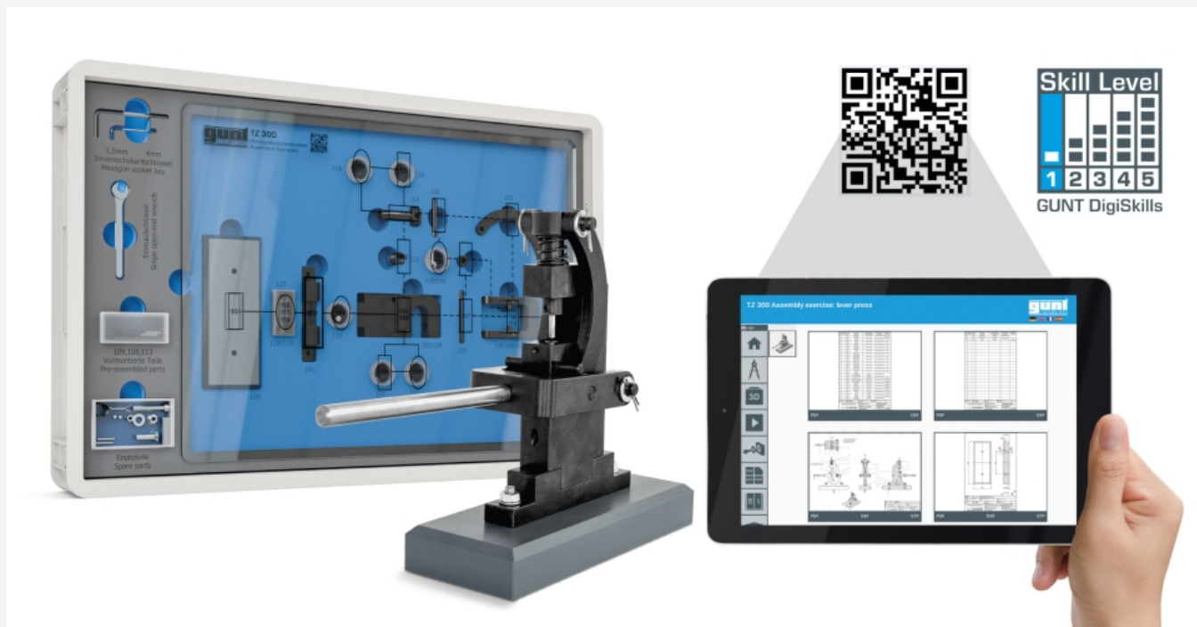
The illustration shows the device and the GUNT Media Center on a tablet (not included).