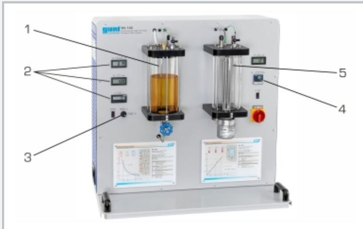
1 tank 1 for isothermic change of state, 2 digital displays, 3 switching between compression and expansion with 5/2-way valve, 4 heating controller, 5 tank 2 for isochoric change of state