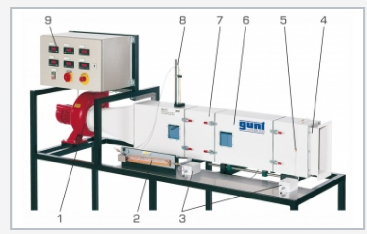
1 fan with throttle valve, 2 inclined tube manometer, 3 differential pressure sensor, 4 streamlined inlet, 5 pressure measurement via measuring nozzle, 6 air duct with windows, 7 measuring section for exchangeable accessories, 8 Pitot tube, 9 displays and controls