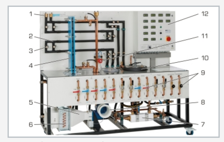
1 bleed valve, 2 tubular heat exchanger, 3 temperature sensor, 4 plate heat exchanger, 5 air duct, 6 finned tube heat exchanger, 7 shell & tube heat exchanger, 8 fan, 9 adjustable fittings, 10 stirred tank with double jacket and coiled tube, 11 pressure sensor (water), 12 switch cabinet