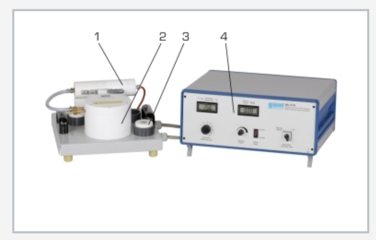
1 experimental setup for linear heat conduction, 2 experimental setup for radial heat conduction, 3 measuring object, 4 display and control unit