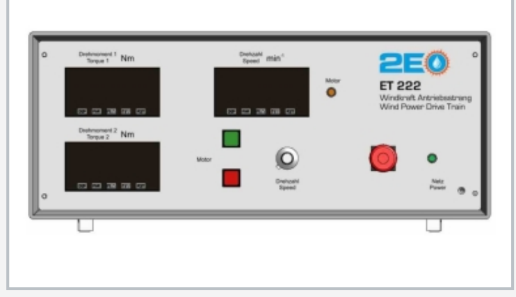
measuring amplifier with digital displays and control elements