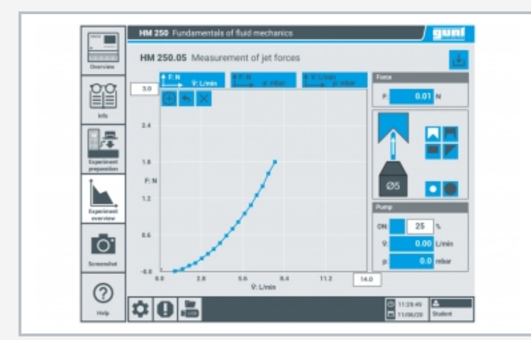
User interface in the touch screen: graphical representation of the measured values, jet force as a function of flow rate for the deflector with deepening in form of a cone and nozzle Ø 5mm

1 nozzle Ø 5mm, 2 nozzle Ø 7,1mm, 3 deflector flat surface, 4 deflector deepening in form of a cone, 5 deflector deepening in form of a truncated cone, 6 deflector inclined surface, A detail view