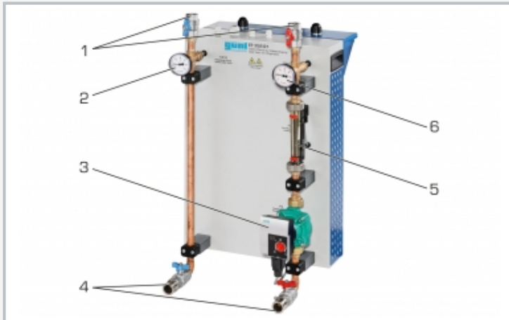
1 feed/return line ET 352, 2 return line thermometer, 3 circulating pump, 4 feed/return line HL 313, 5 flow rate sensor, 6 feed line thermometer