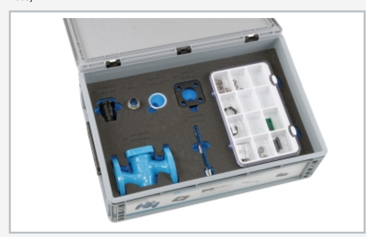
Storage system with foam inlay: all components have their place, the foam is labeled