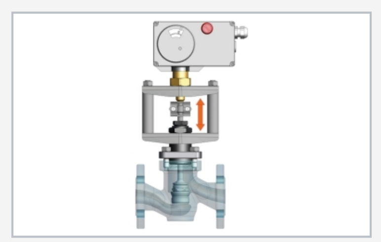
Transparent sectional view of the assembled control valve (screenshot from assembly video)