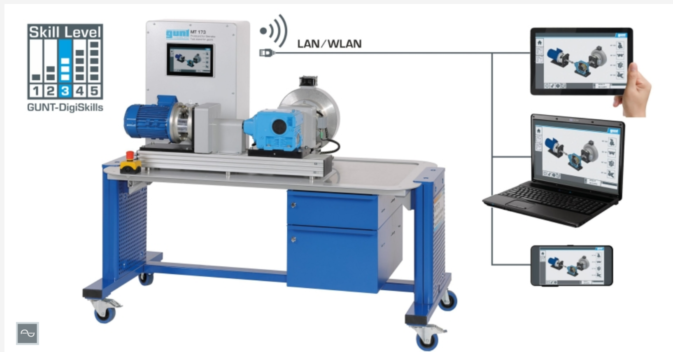
The illustration shows MT 173 together with MT 123 Spur and worm gear, screen mirroring is possible on different end devices