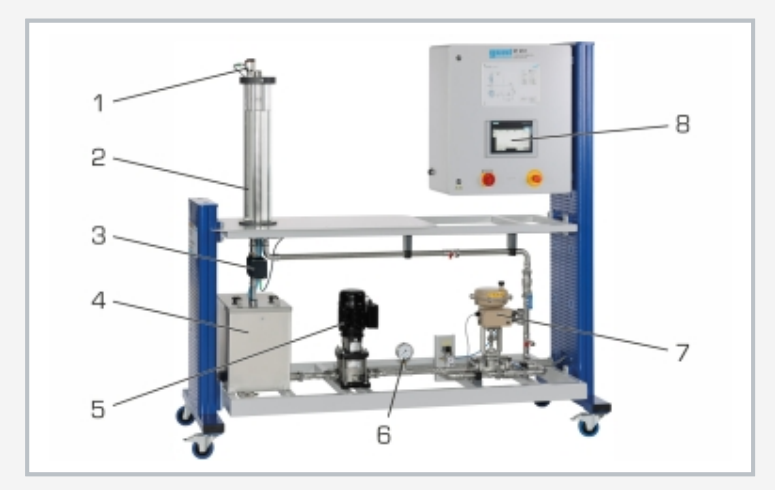
1 smart level sensor, 2 transparent tank, 3 proportional valve with motor drive, 4 storage tank, 5 pump, 6 manometer, 7 control valve, 8 touch screen