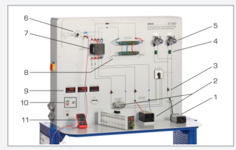
1 inverter, 2 accumulators, 3 current and voltage measuring point, 4 switch for electrical load, 5 bulbs as consumers, 6 wind power plantbrake switch, 7 charge controller, 8 load resistances, 9 displays for wind velocities and speed, 10 control elements for axial fan, 11 multimeter