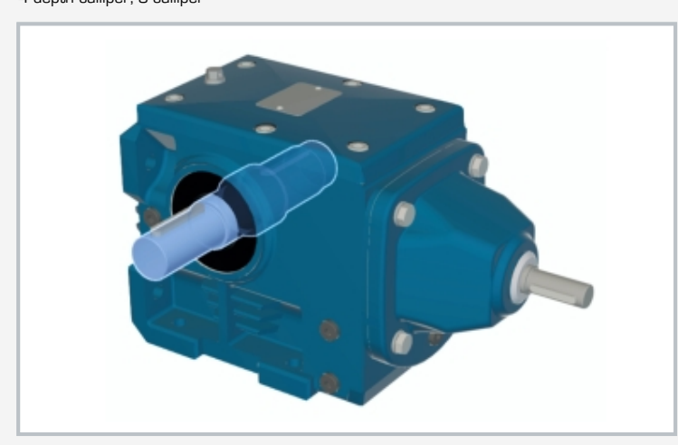
Output shaft in the functional relationship: MT 123 spur and worm gear with highlighted driven shaft