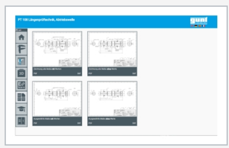
Screenshot of the GUNT Media Center