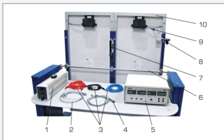
1 slide resistor, 2 power cable, 3 set of cables for parallel and series connection, 4 measuring cable, 5 measuring amplifier, 6 inclination axis, 7 inclinometer, 8 illuminance sensor, 9 temperature sensor, 10 solar modules