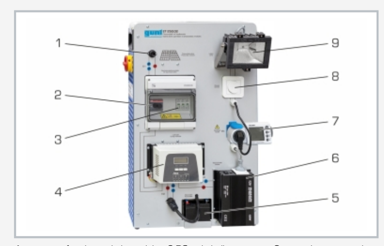
1 connector for photovoltaic modules, 2 DC switch-disconnector, 3 over voltage protection, 4 charge regulator, 5 accumulator, 6 inverter, 7 energy meter, 8 dimmer, 9 halogen lamp