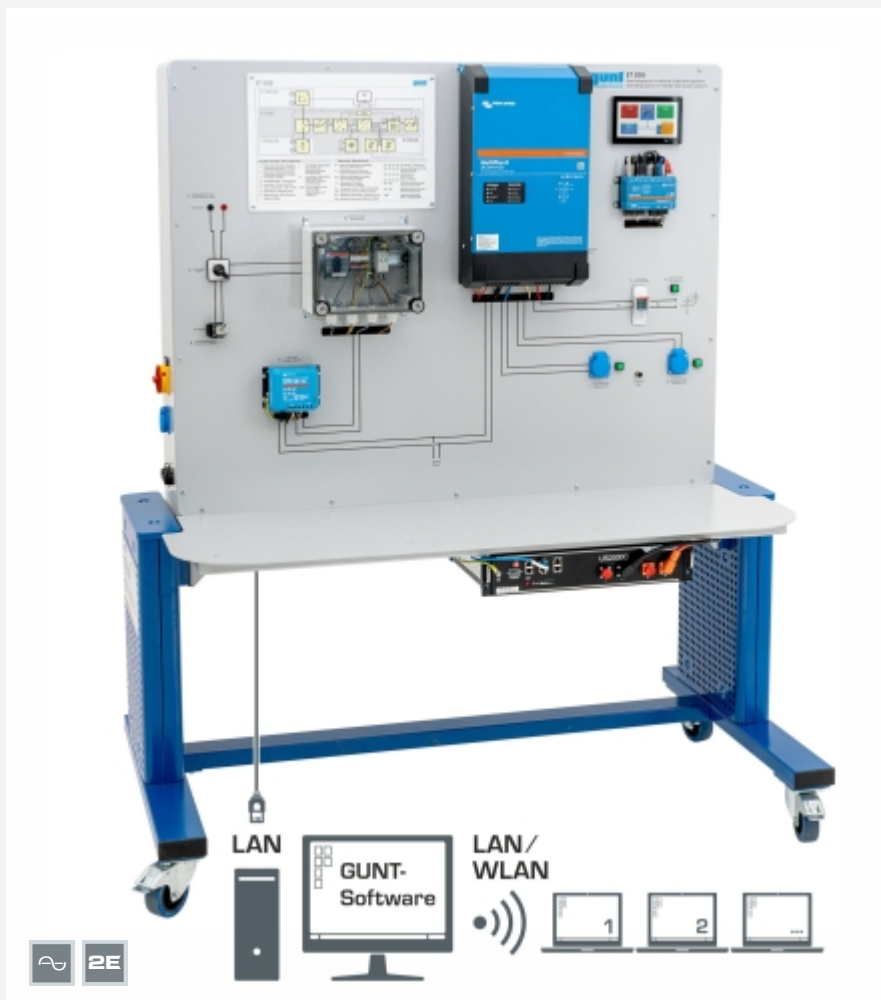
Network capable GUNT software: control and operation via 1 PC. Observation, acquisition, analysis of the experiments at any number of workstations via the customer's own LAN/WLAN network.