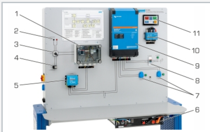
1 circuit breaker and overvoltage protection, 2 photovoltaic simulator connection, 3 toggle switch between photovoltaic simulator/photovoltaic modules, 4 photovoltaic modules connection, 5 MPP charge controller, 6 LiFePO accumulator, 7 alternating current consumers connection, 8 bidirectional electricity meter, 9 grid inverter, 10 communication and control unit, 11 touch screen