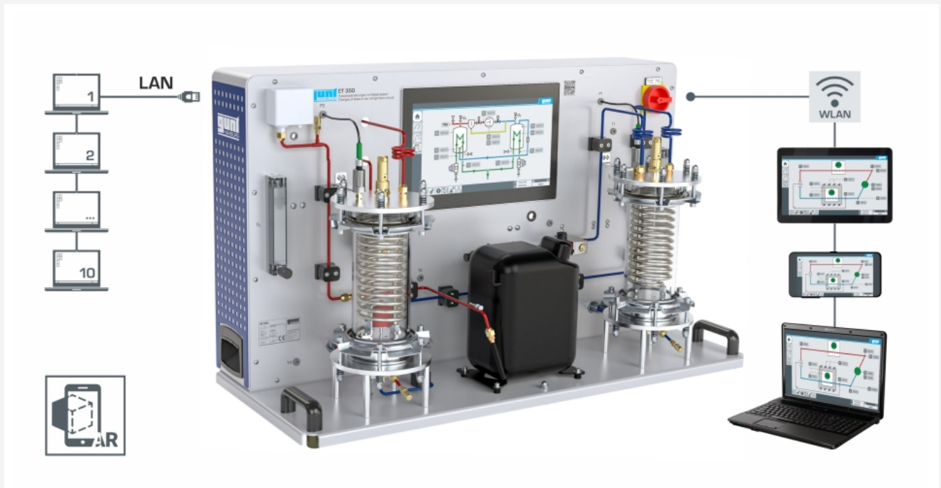
screen mirroring is possible on up to 10 end devices