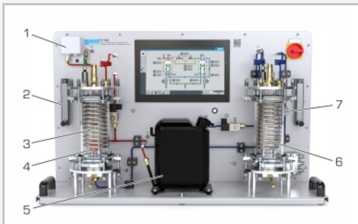
1 pressure switch, 2 flow meter, 3 condenser, 4 expansion valve, 5 compressor, 6 evaporator, 7 sight glass