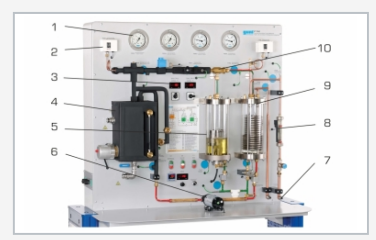
1 manometer, 2 pressure switch, 3 displays and controls, 4 vapour generator, 5 evaporator, 6 pump, 7 cooling water connections, 8 flow meter, 9 condenser, 10 vapour jet compressor