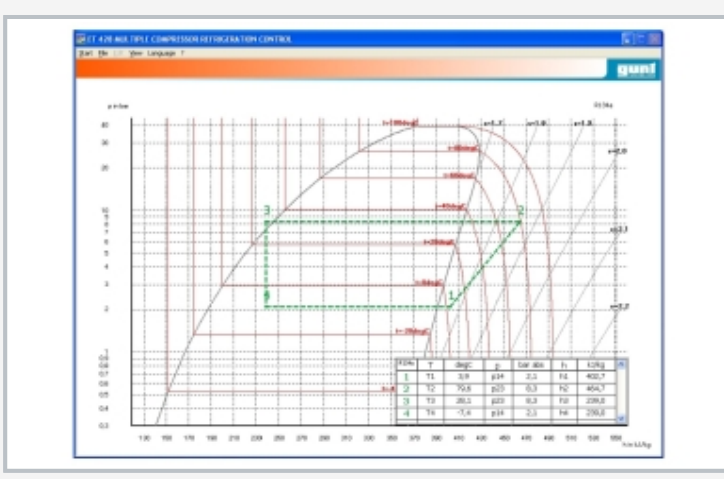
Software screenshot: log p-h diagram

1 heat exchanger, 2 evaporator, 3 expansion valve, 4 cooling tank with heater (cooling load), 5 receiver, 6 condenser, 7 oil separator, 8 compressor; T temperature, P pressure, F flow rate, PSH, PSL pressure switch; blue: low pressure, red: high pressure, green: water circuit, yellow: oil return