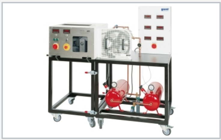
The illustration shows a complete experimental setup with ET 513 and HM 365