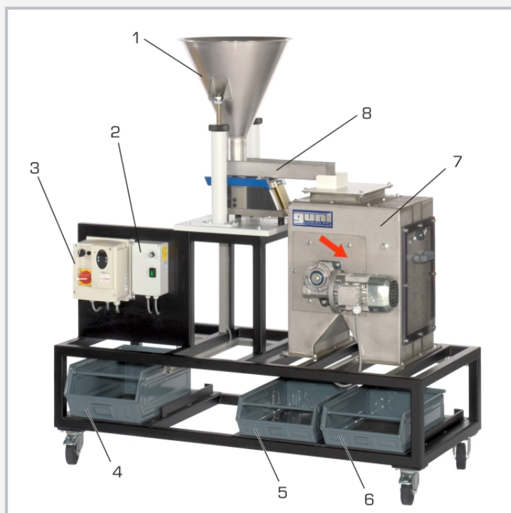
1 feed hopper with height adjuster, 2 vibrating trough controls, 3 magnetic separator controls, 4 solid compound tank, 5 magnetic materials tank, 6 non-magnetic materials tank, 7 magnetic separator, 8 vibrating trough