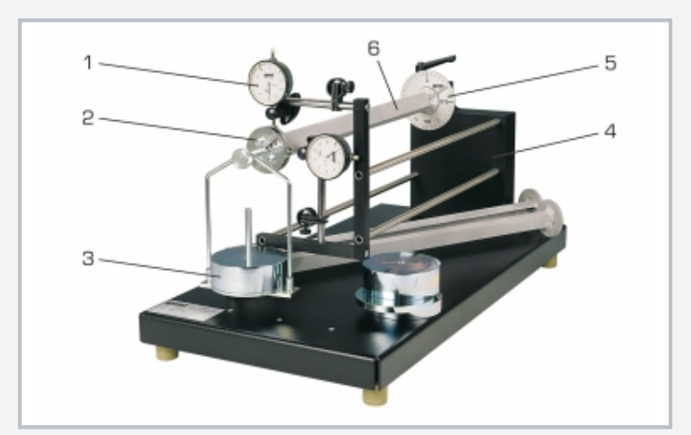
1 dial gauge, 2 device to adjust the eccentricity of the load application point and flange to mount the load, 3 weight, 4 clamping pillar, 5 clamping flange of beam with angle scale, 6 beam