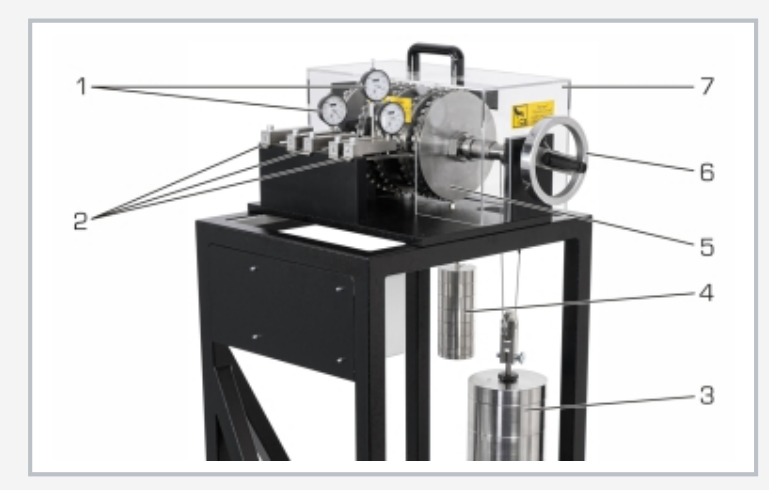
1 dial gauge, 2 bending beam, 3 set of weights, 4 set of weights for measuring transmission ratios, 5 planetary gear, 6 handwheel, 7 protective cover