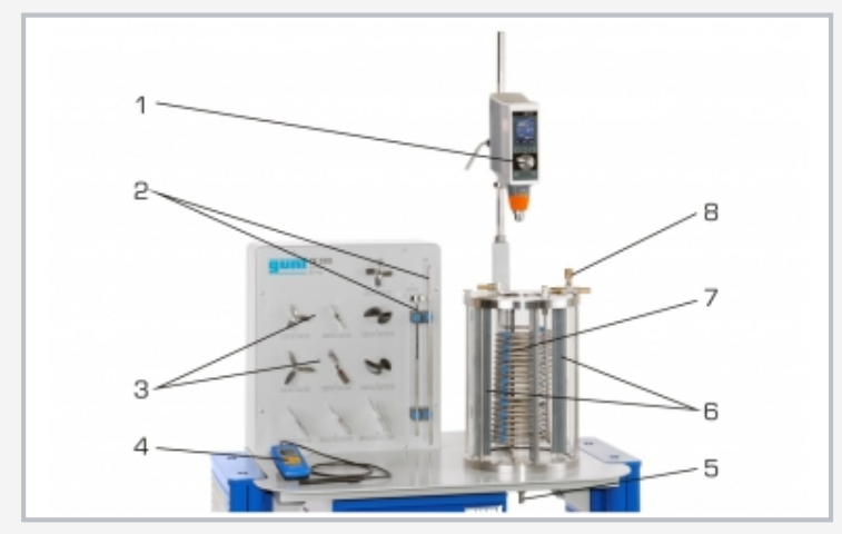
1 stirring machine with speed and torque indicator, 2 turbine stirrer and threaded shaft for stirring heads, 3 stirrer elements, 4 conductivity meter, 5 outlet, 6 flow impeder, 7 coiled tube, 8 shut-off valve for coiled tube