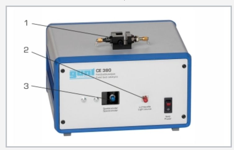
Photometer: 1 cuvette holder, 2 light source connection, 3 spectrometer connection