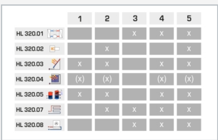
Recomended combinations of the HL 320 modular system