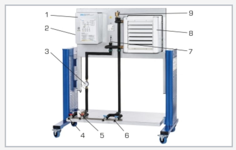
1 junction box, 2 CAN-bus connecting sockets, 3 flow meter, 4 feed flow, 5 3-way mixing valve, 6 return flow, 7 temperature sensor feed flow, 8 fan convector, 9 vent valve