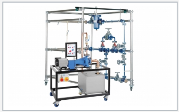
The picture shows HL 960 with a completed specimen installation, in the foreground HL 960.01