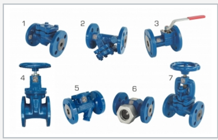
1 non-return valve, 2 strainer, 3 3-way ball valve, 4 Wedge gate valve, 5 steam trap, 6 sight class. 7 shut-off valve