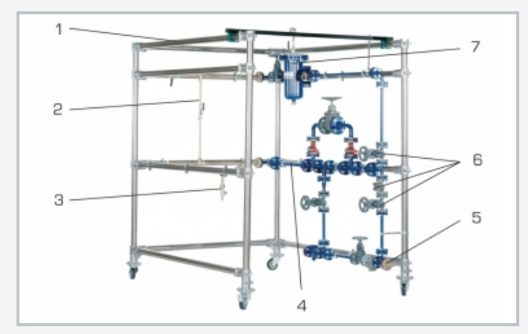
1 mobile frame, 2 DN15 pipe, 3 connection for HL 960.01 (outlet), 4 DN25 pipe, 5 connection for HL 960.01 (inlet), 6 various valves and fittings, 7 pressure vessel with manometer