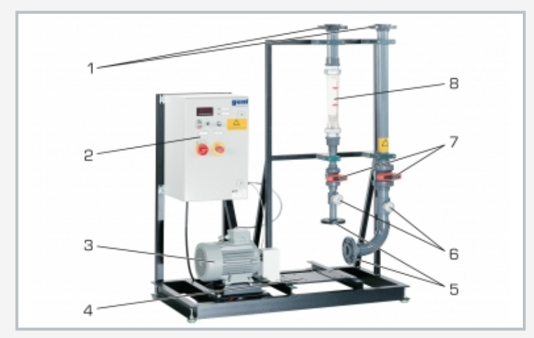
1 flange connections to connect HL 962 to HL 962.30, 2 switch box with displays and controls, 3 electric motor, 4 mounting plate for test pump, 5 flange connections for test pump, 6 manometer, 7 valve, 8 flow meter