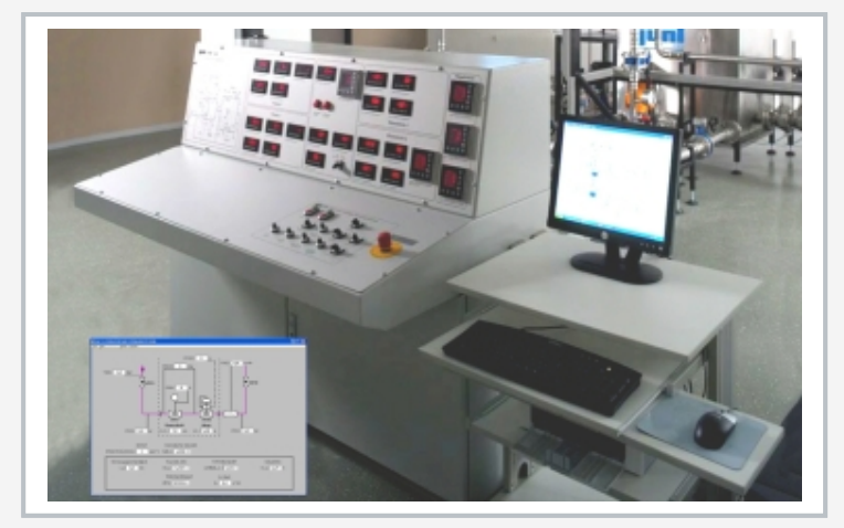
Control station consisting of control console and data acquisition for convenient recording and analysis of the experiments

Complex process schematic: 1 upper priming tank, 2 additional tank in lower level, 3 measuring location for control valves, 4 measuring location for pipe sections; green: measuring section DN50, red: measuring section DN20/25, blue: pipes