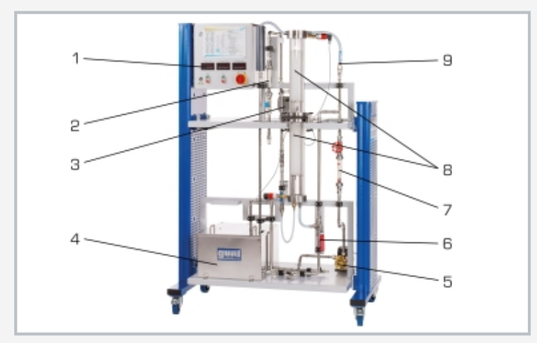
1 digital pressure indicators, 2 air flow meter, 3 compressor for air, 4 storage tank, 5 pump for water, 6 bottom rising-falling switch valve, 7 water flow meter, 8 two-piece packed column, 9 top rising-falling switch valve