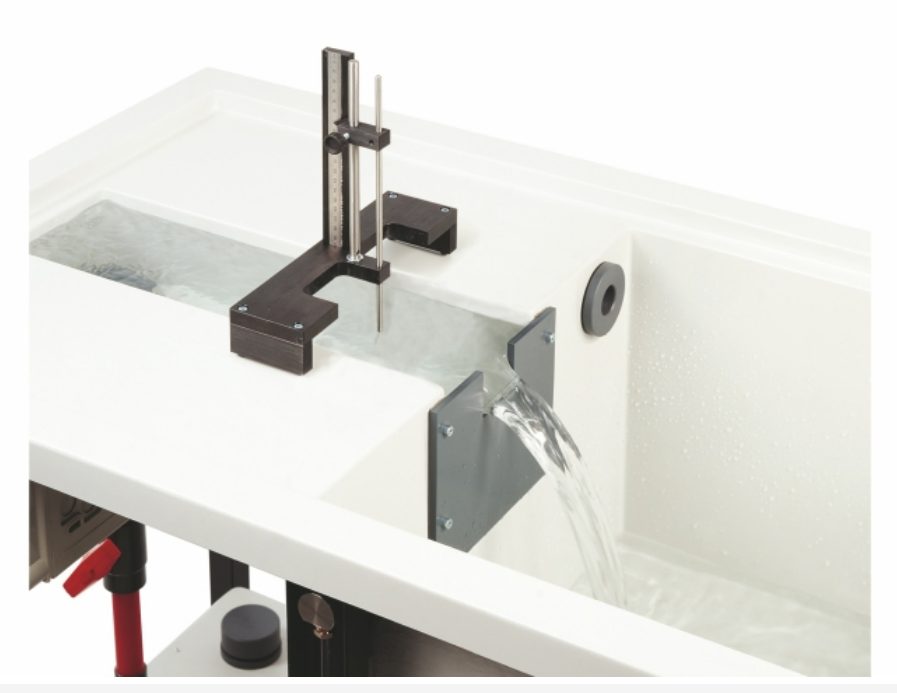
Plate weirs for HM 150

The illustration shows a Rehbock weir incorporated into the HM 150 base module.