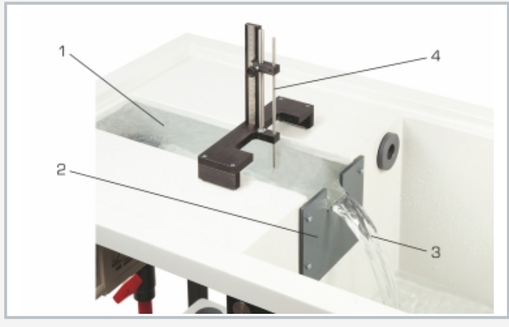
Plate weirs for HM 150

1 experimental flume from HM 150, 2 Rehbock weir, 3 nappe, 4 level gauge