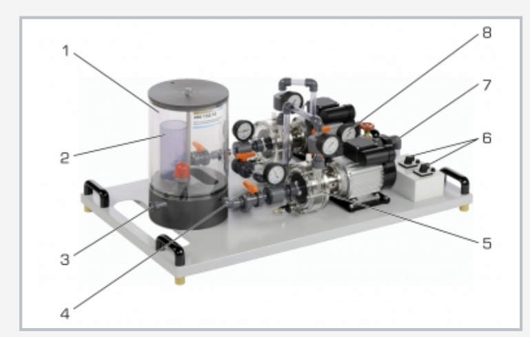
1 tank, 2 overflow, 3 water connection, 4 ball valve, 5 pump, 6 pump switch, 7 drain, 8 manameter