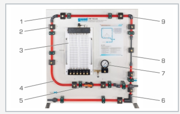
1 narrow pipe bend, 2 annular chamber, 3 6 tube manometers, 4 wide pipe bend, 5 ball valve, 6 segment bend, 7 Bourdon tube pressure gauge, 8 contraction/enlargement, 9 pipe angle