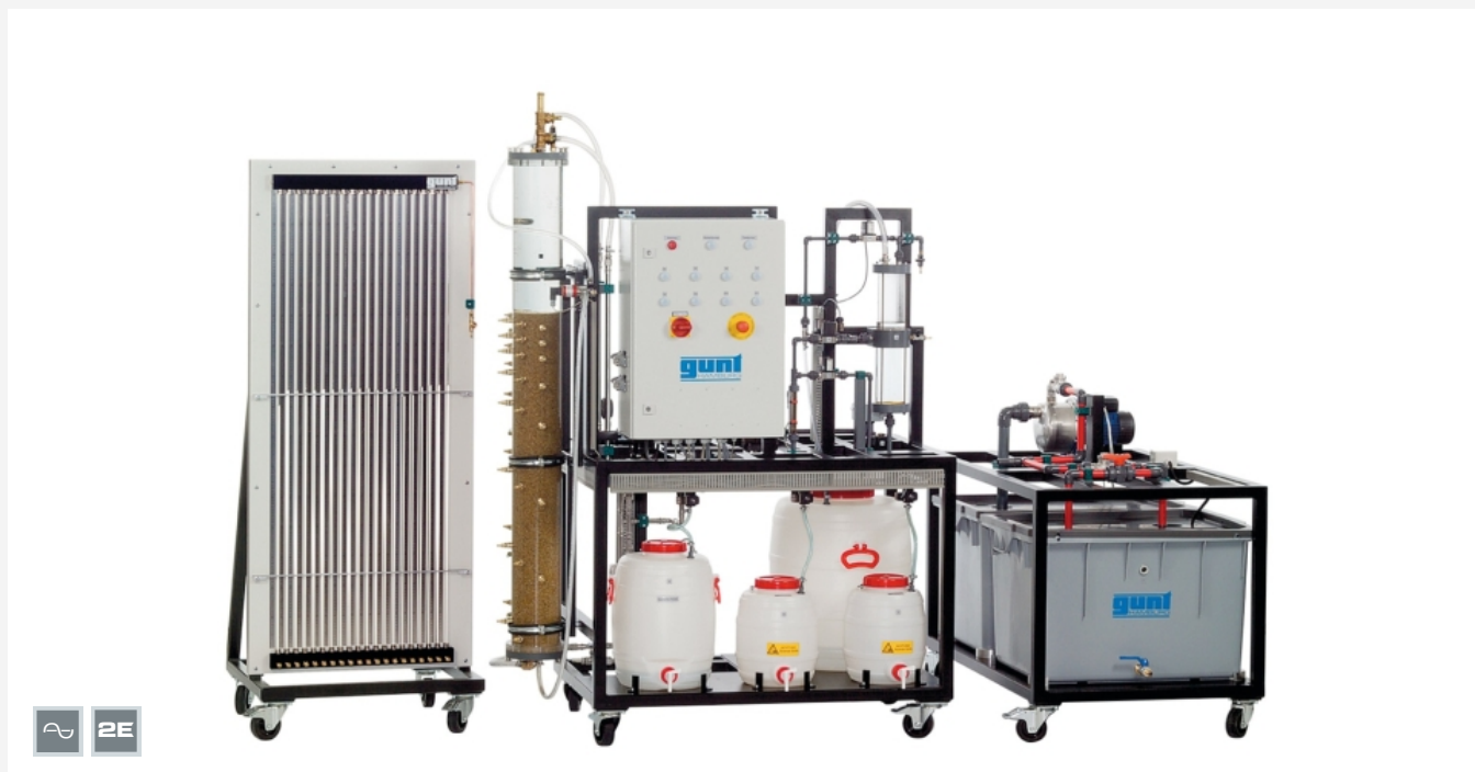
The illustration shows from left to right: manometer board, trainer, supply unit