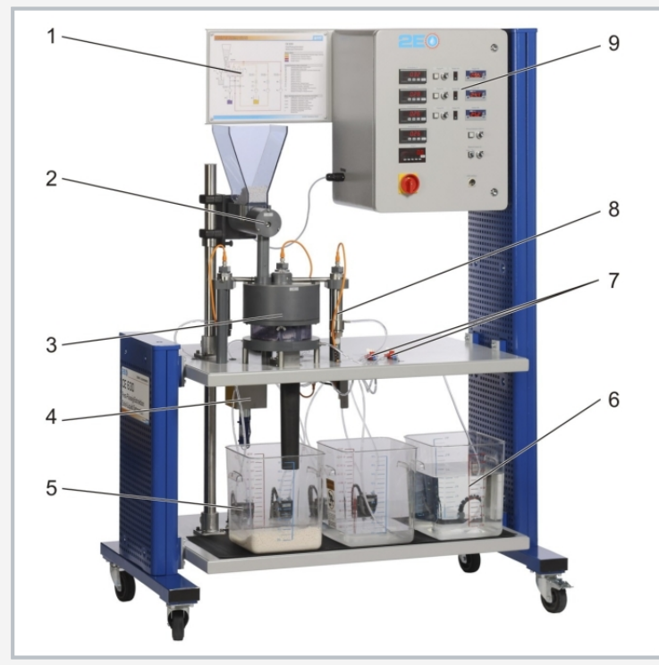
1 process schematic, 2 spiral conveyor for extraction material, 3 revolving extractor, 4 revolving extractor drive unit, 5 pump (behind the tanks), 6 tank, 7 mode selector valves, 8 heater and solvent feed, 9 switch cabinet with controls