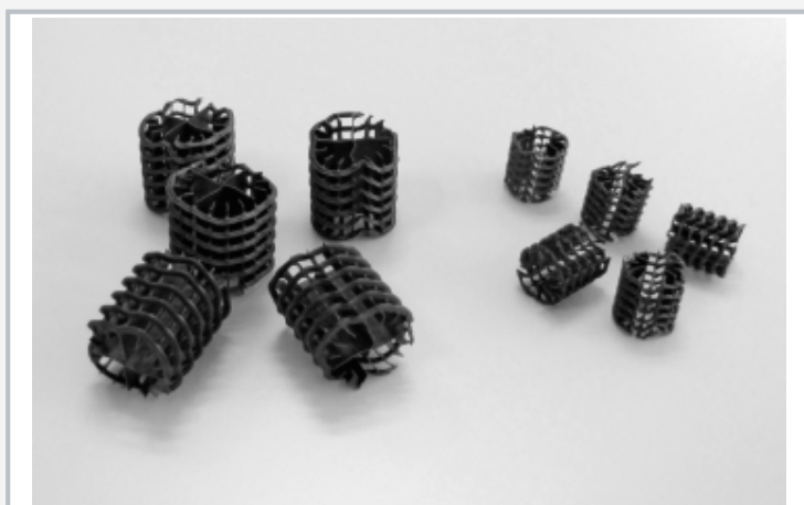
carrier material for biofilm